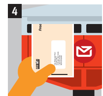
Post it in a New Zealand Post mailbox by Thursday 20 August 2009 to ensure it arrives on time

If you make a mistake, destroy, lose or don't receive your voting paper, visit www.elections.org.nz or Freephone 0800 36 76 56 for advice on how to get a replacement voting paper.