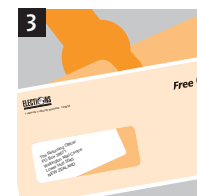
Make sure the Returning Officer's address on the back of the voting paper is showing through the window of the envelope